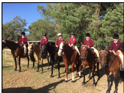
Children competing at Moonbi Horse Sports

How we do it – If we model and explain to our children the right way to do things (our jobs, cleaning up, helping others, not taking short cuts etc) they will grow up with a sense of right and wrong and do everything with a sense of excellence.