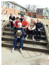
Some of the AMAZING Book Week Costumes